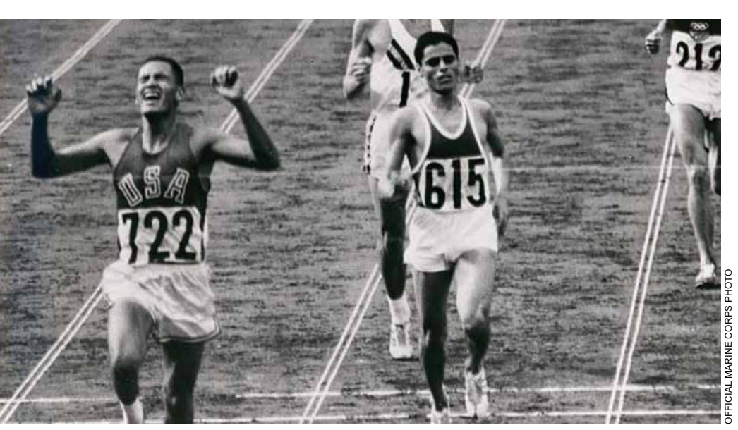
Billy Mills breaks the tape in the 10,000-meter run to take gold in the 1964 Olympics.

the 10,000-metre run; among those favored to win was Ron Clarke, of Australia, who held the world record. On a wet track. Mills kept pace with the leaders until the final lap, when Clarke and